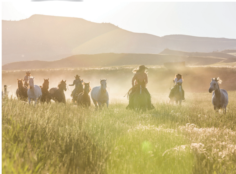
The Art of the Cowgirl gathering, to be held this month in Phoenix, Arizona, spotlights the craftsmanship, art, horses and spirit of the West.